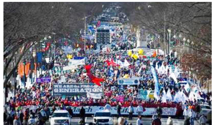
March for Life Washington, DC 2015

Thank you to all those who registered for the trip already! I look forward to traveling and Marching with you on January 27th.