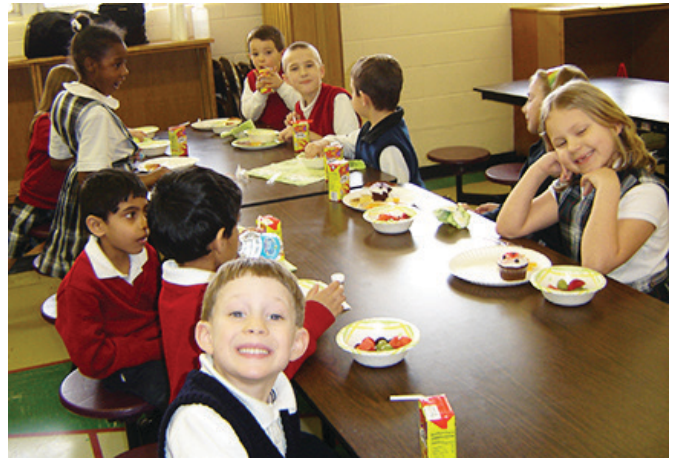
1st Graders at St. Raphael’s Kindergarten/1st Grade Baby Shower