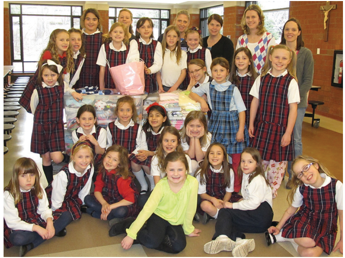
Our Lady of Victory Brownie Troop, Northville

In March, I was privileged to attend a Brownie troop meeting at Our Lady of Victory Parish in Northville. The scouts had passed out Easter eggs at church that were filled with a jelly bean representing a tiny baby and a note asking for a baby item. They presented an overwhelming collection of gifts and told me of their project as they pointed to their beautiful, handpainted mural that depicted each step. What a sweet, caring group of little girls they are!