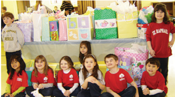
Kindergartners at St. Raphael’s Kindergarten/1st Grade Baby Shower Garden City