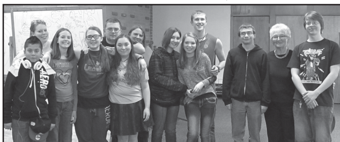
Youth group that came to Sts. Simon & Jude Baby Shower to help